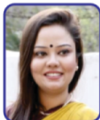
Akanksha Vidyrathi Commissioner (India)